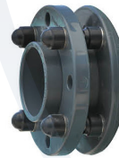
Double Flange Connections with Screws