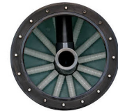
40 cm Large Lid Opening